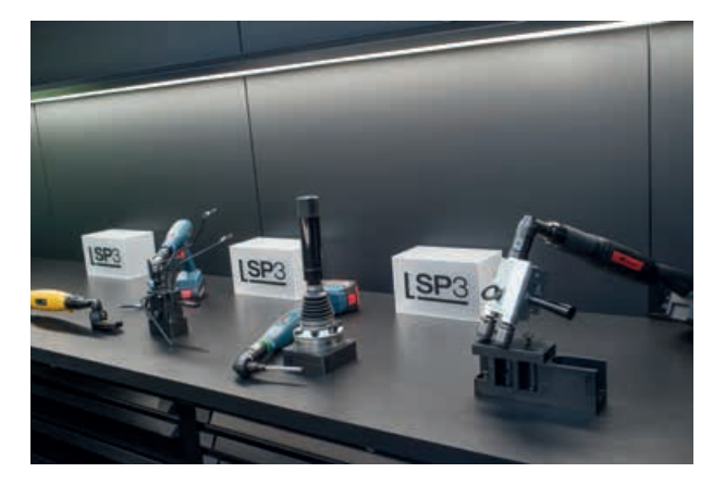
Practical fastening stations to try out.