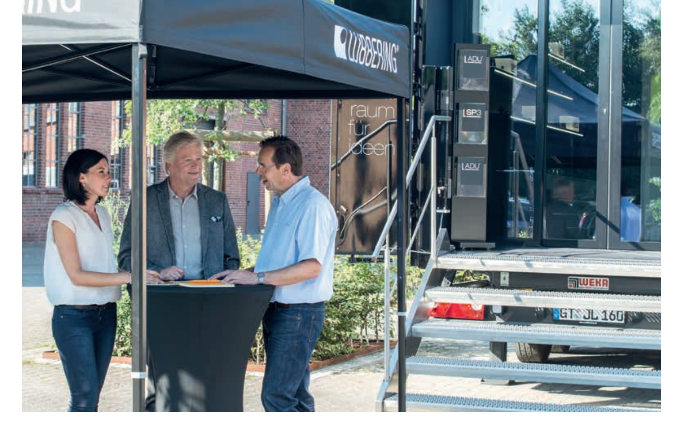
The ultimate in individuality: The raum für ideen is there for you all day long.