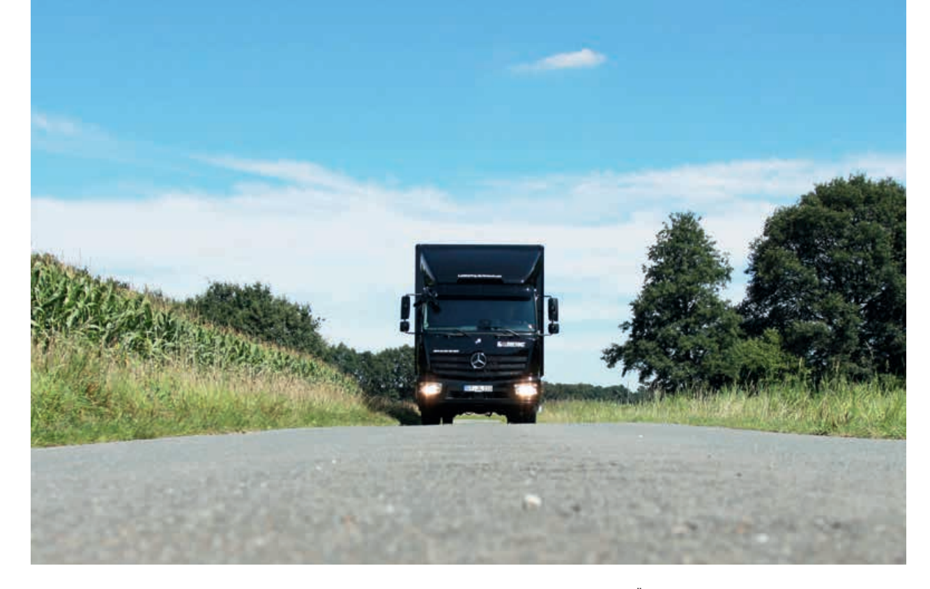
From the idea onto the road: The LÜBBERING ShowTruck is ready for the tour.